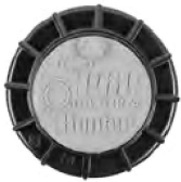
PGP Ultra Reclaimed Available as a factory-installed option on all models