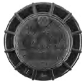
PGP Ultra Easy arc and radius adjustment