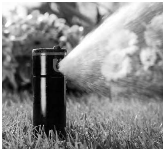
I-20 04 with PRB Body

Pressure Regulation Continual operating pressure of 3.1 bar; 310 kPa